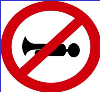
No Horn boards