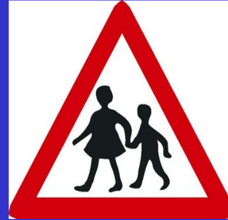
School Zone boards